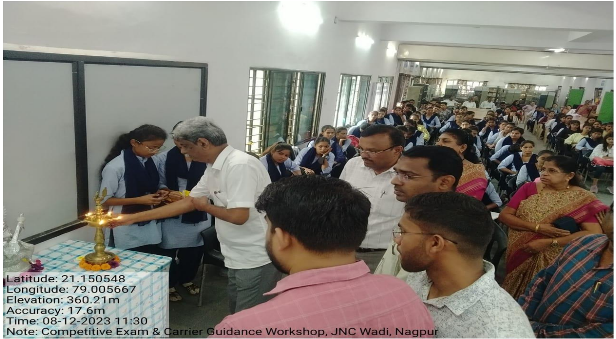
Latitude: 21.150548 Longitude: 79.005667 Elevation: 360.21m Accuracy: 17.6m Time: 08-12-2023 11:30 Note: Competitive Exam & Career Guidance Workshop, JNC Wadi, Nagpur