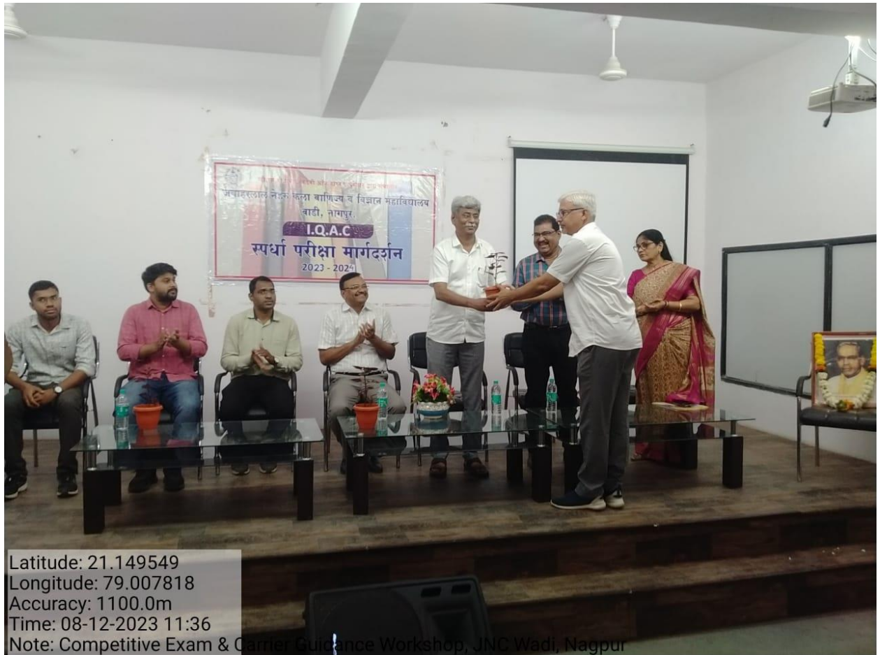
Latitude: 21.149549 Longitude: 79.007818 Accuracy: 1100.0m Time: 08-12-2023 11:36 Note: Competitive Exam & Career Guidance Workshop, JNC Wadi, Nagpur