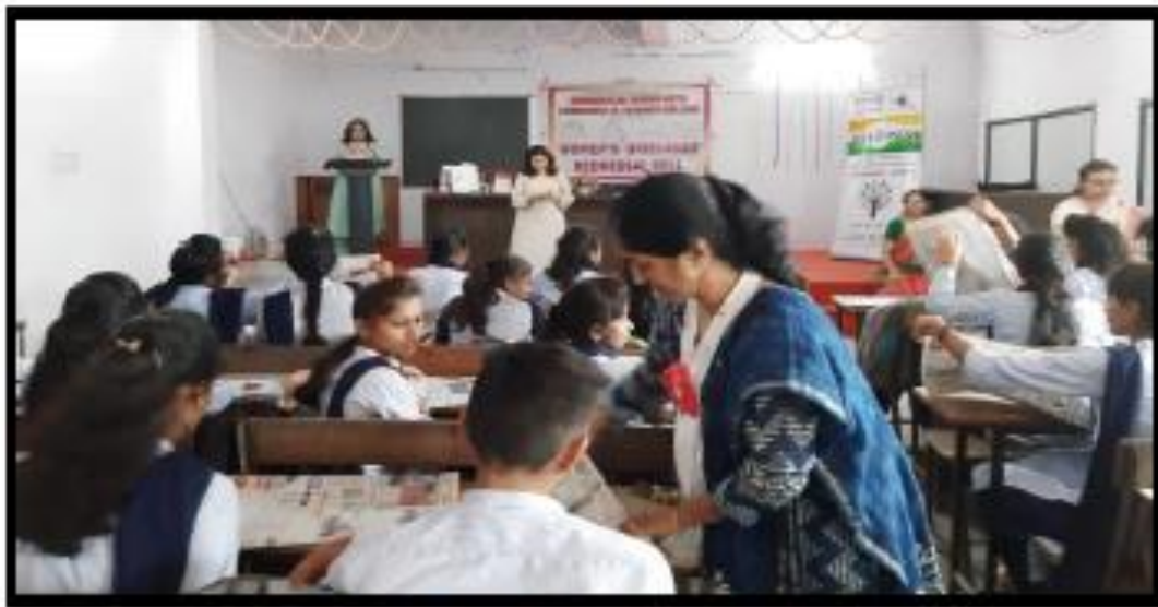
(Students are taught how to make newspaper bags)

[Signature] Offg. Principal Jawahar Nehru Art, Commerce & Science College, Wadi.