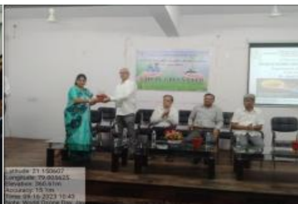
Latitude: 21.150607 Longitude: 79.005425 Elevation: 360.61m Accuracy: 15.8m Time: 09-16-2023 10:43 Note: World Ozone Day, Ja