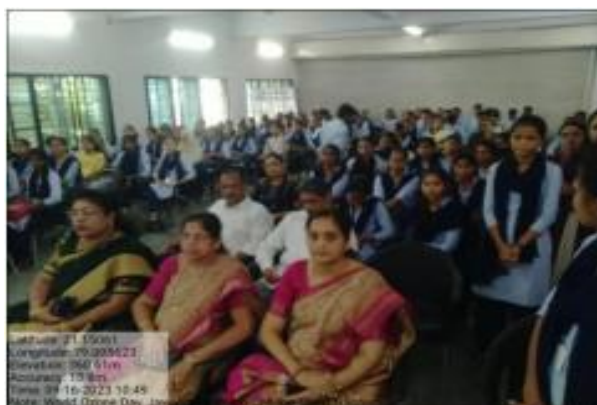
Latitude: 21.15061 Longitude: 79.005423 Elevation: 360.61m Accuracy: 15.8m Time: 09-16-2023 10:45 Note: World Ozone Day, Ja