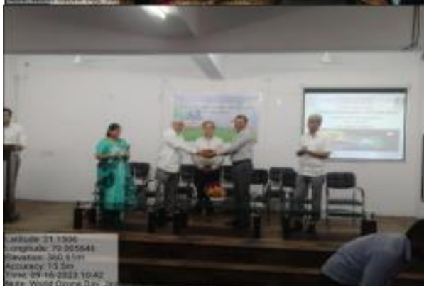
Latitude: 21.15066 Longitude: 79.005448 Elevation: 360.61m Accuracy: 15.8m Time: 09-16-2023 10:42 Note: World Ozone Day, Ja