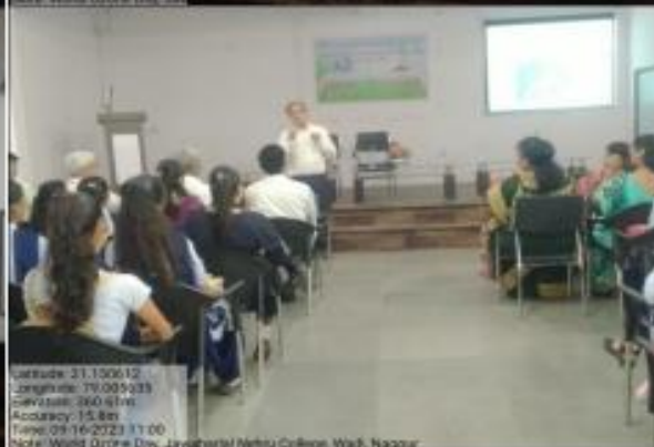
Latitude: 21.150612 Longitude: 79.005433 Elevation: 360.61m Accuracy: 15.8m Time: 09-16-2023 11:00 Note: World Ozone Day, Jawaharlal Nehru College, Wadi, Nagpur